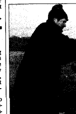
Preventive measures: Volcanoes help pile sandbags on tar, Minn., Sunday. The riv